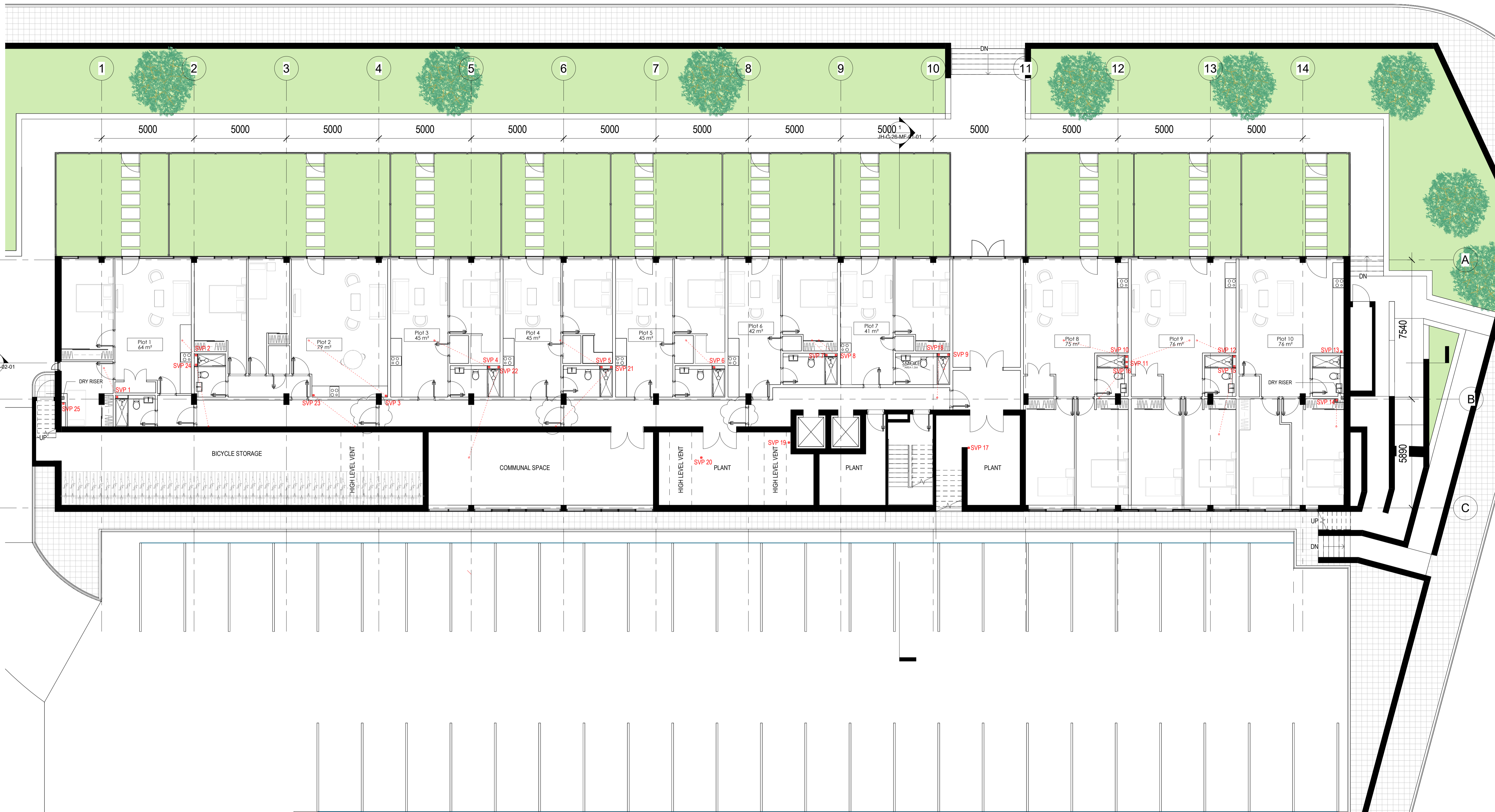
1 GROUND FLOOR 1 : 100